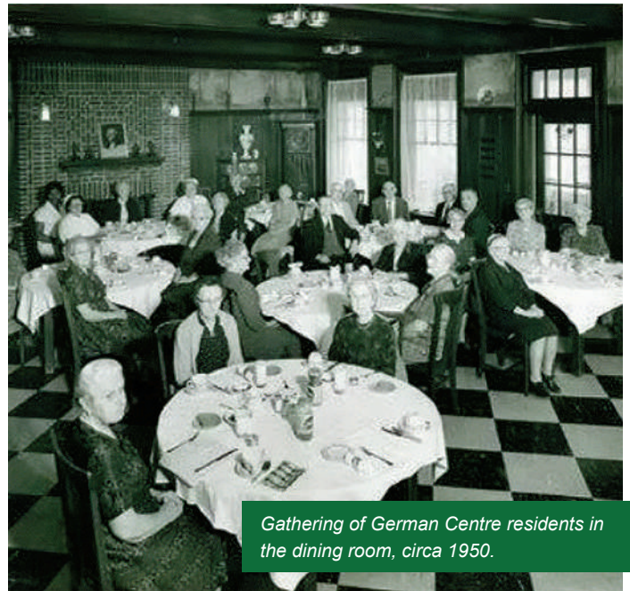
Gathering of German Centre residents in the dining room, circa 1950.